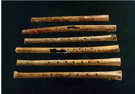
42000 BC/Mammoth tooth flutes

Technology is the knowledge and skill required for the creation or production of tools and devices that assist in meeting the needs of humans.